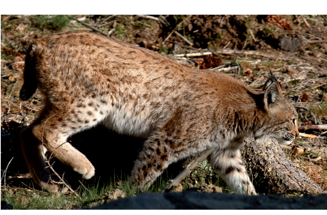
A Eurasian lynx demonstrates its camouflage in a habitat enclosure in a Bavarian Forest.

I once escorted a New Zealand ecologist on his first trip into the British countryside. As we surveyed the pastoral scene from the ridge of the Malvern Hills on the Herefordshire-Worcestershire border, he marvelled at the shaggy, wildlife-rich common land which had escaped the cleans-