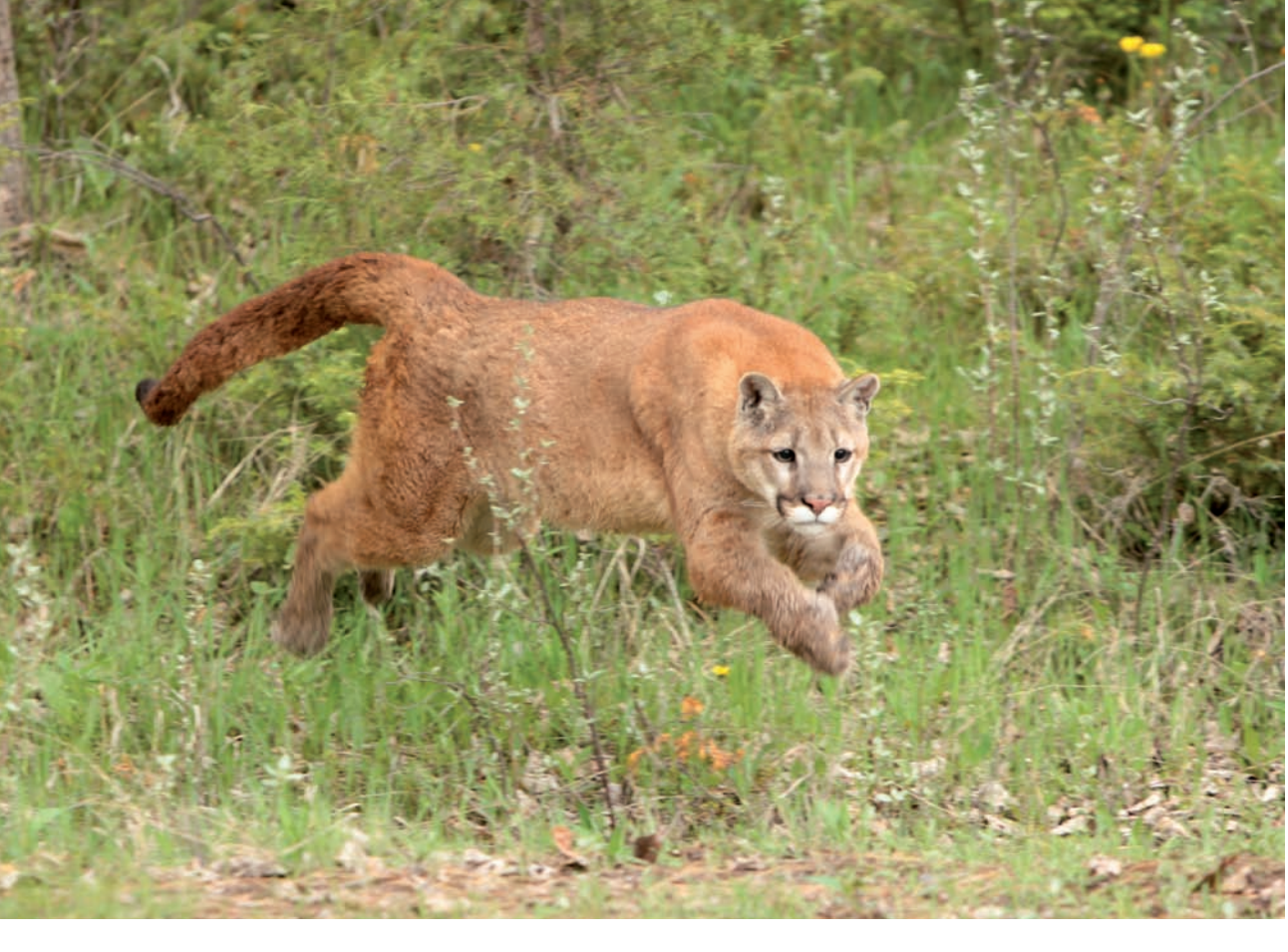
The puma or mountain lion at home in Montana, US. The photo was taken in a large habitat enclosure.